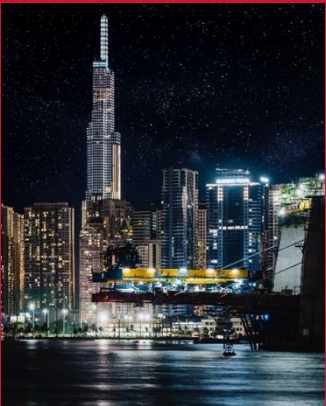
Ho Chi Ming City

Source https://www.linkedin.com/company/76131534/admin/